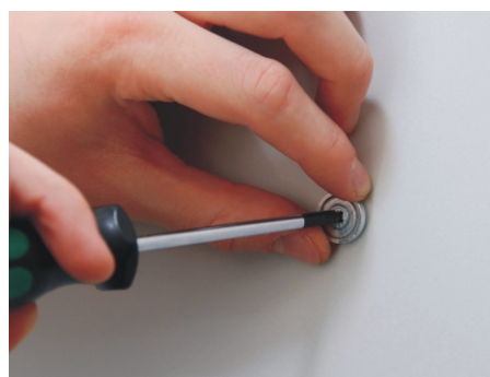
Step 3: Marking of the alarm transmitter on the wall and subsequent installation on the wall