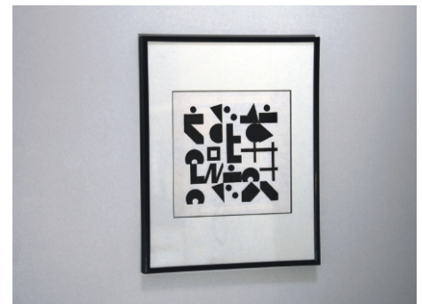
Step 2: Hanging of the painting in order to measure the proper position of the alarm transmitter