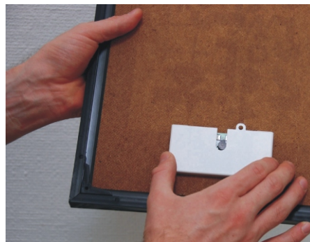
Step 1: Installation of MOUNTING-Protect on rear of the painting